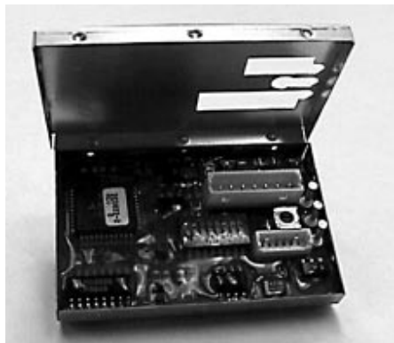
Figure 3a - PWM Module