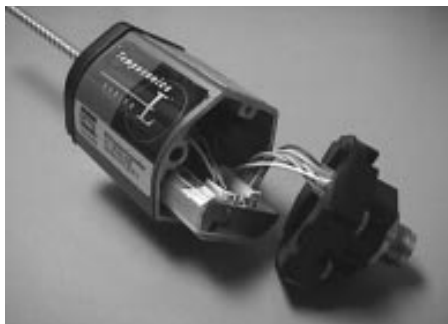
Figure 2 - L Series Sensor